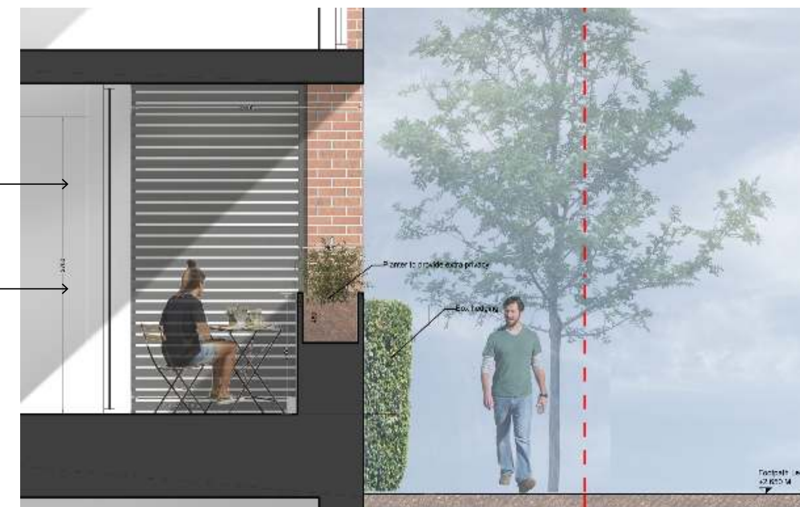
SECTION OF PROPOSED GROUND FLOOR UNIT NOT TO SCALE